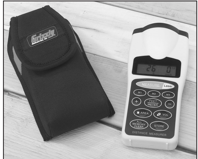
The Model H5844 Range Finder.