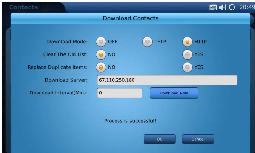
Figure 3: Phonebook.xml Download Successful

GXV3175 will start downloading the XML Phonebook and display the download status message on the phone's LCD screen. If the download is successful, the message "Process is successful!" will be displayed on the bottom of the screen. See Figure 3.