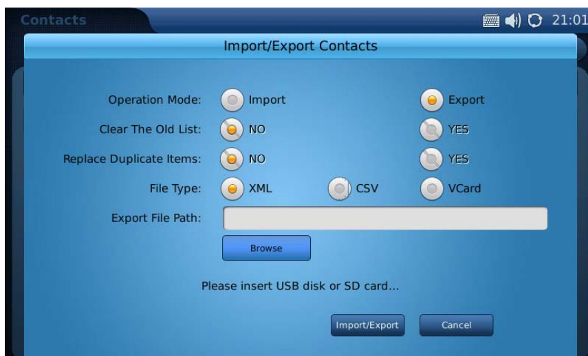
Figure 7: Export Phonebook via Touch Screen