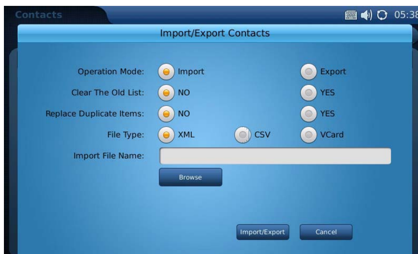
Figure 6: Import/Export Phonebook on GXV3175

When using phone's touch screen to import/export phonebook, users need to insert SD card or USB flash drive first. Then access the phonebook application by selecting MENU-> Contacts in the main screen. (See Figure 1) Press the "Options" button and select "Import/Export" in the dropdown list. Then the screen will show as Figure 6.