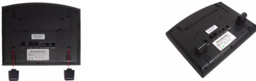
Figure 2: Attach the wall-mount spacers to the GXP2010

To position the phone on the wall, place two fixed hangers on the wall, hang the back of the phone on the fixed hangers.