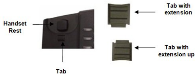
Figure 4: Placing tab for mounting phone to wall