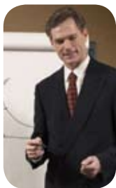
Boss Access: All Features

Walk-up copying, scanning, and faxing are all great conveniences. However, you may want to limit access to select features, especially if you are handling confidential records and data, or to restrict access to printing to keep your operating costs down. So the MFC-9840CDW provides the ability for your administrator to set various levels of password-protected access to certain features, for each of up to 25 different users per machine.