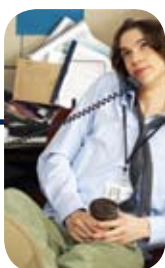
Intern Access: Copy Only