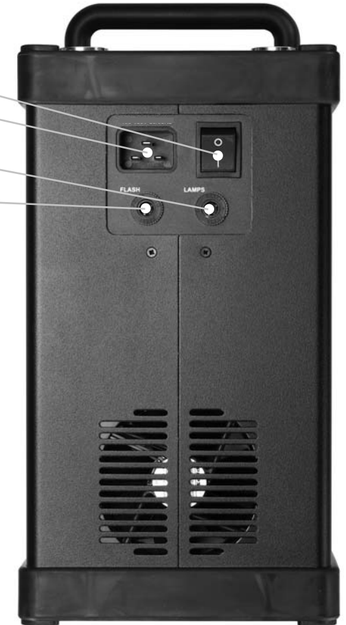
The AC Inlet, On/Off Switch and Thermal Reset Buttons are mounted on the rear panel.

3 The Fast/Slow Switch, Overall Power Selector and Modelling Mode Selector are common to both channels.