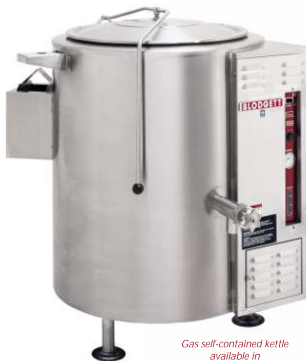
Gas self-contained kettle available in tilting or stationary