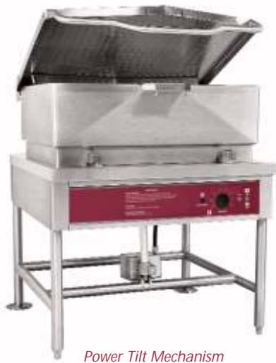
Power Tilt Mechanism

The Blodgett manual tilt mechanism features side trunnion pivots for easy tilting.