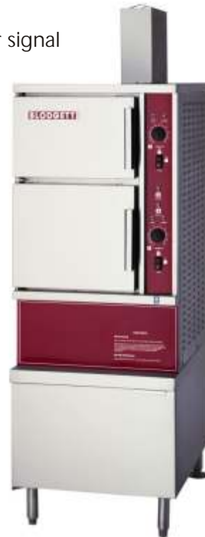
Cabinet Base Gas Convection Steamers