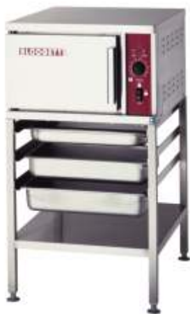
Countertop Electric & Gas Convection Steamers