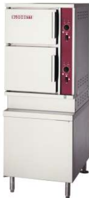
Cabinet Base Electric Convection Steamers