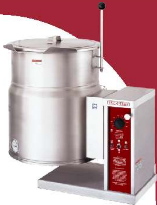
Tilting countertop kettles are available in electric or direct steam