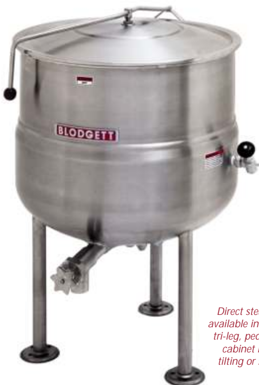
Direct steam kettles available in countertop, tri-leg, pedestal base, cabinet base and tilting or stationary