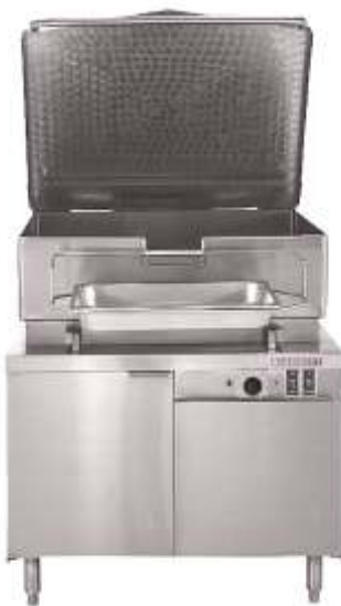
Heavy Duty Hydraulic Tilt Mechanism

Manual Gearbox tilt mechanism for gas and electric braising pans