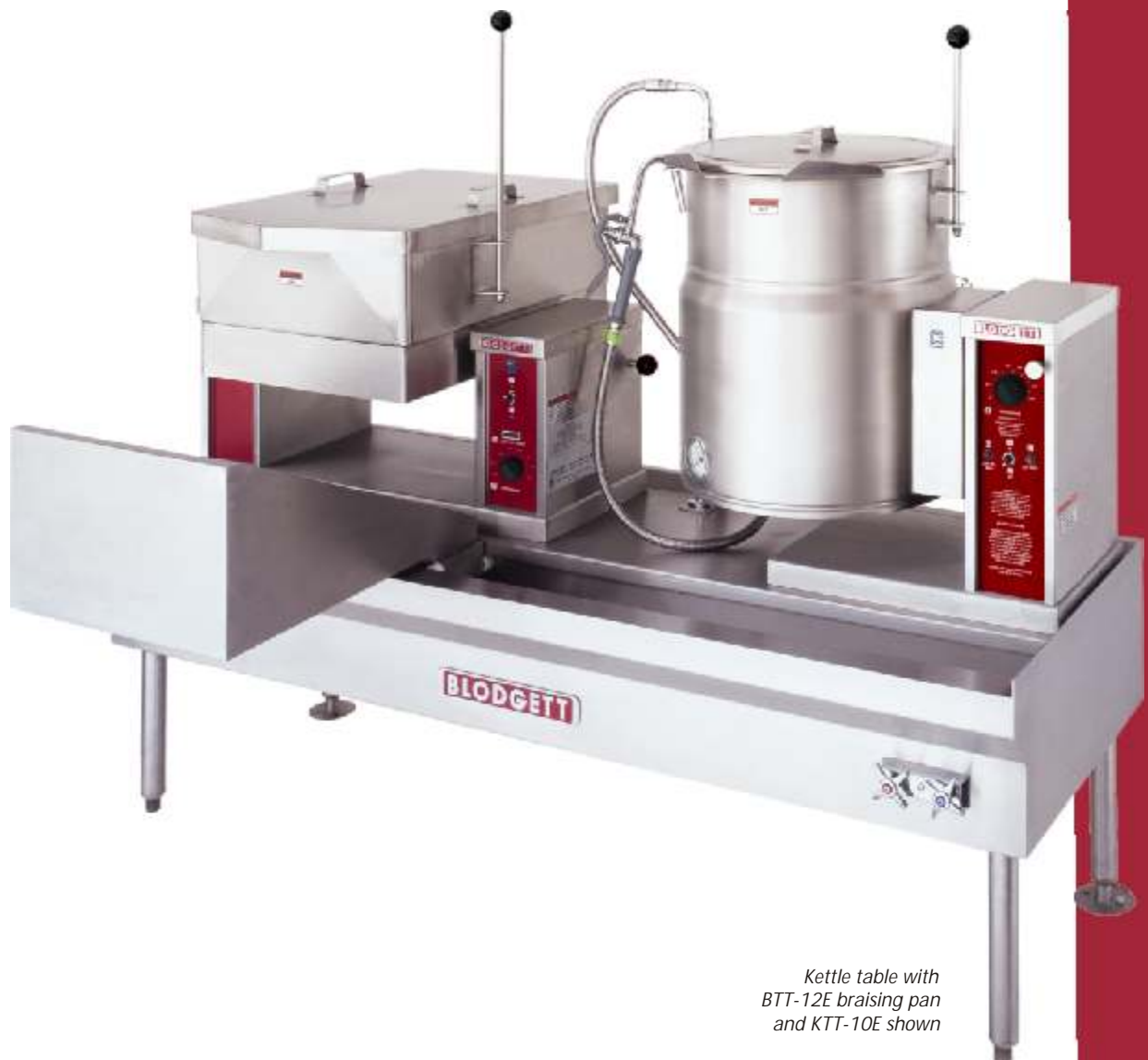
Kettle table with BTT-12E braising pan and KTT-10E shown

All built with the rugged durability and quality you have come to expect from Blodgett.