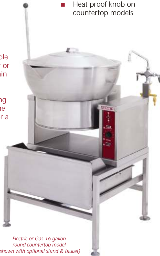
Electric or Gas 16 gallon round countertop model (shown with optional stand & faucet)

The countertop braising pans also mount to the Blodgett kettle table for a truly customized workspace.