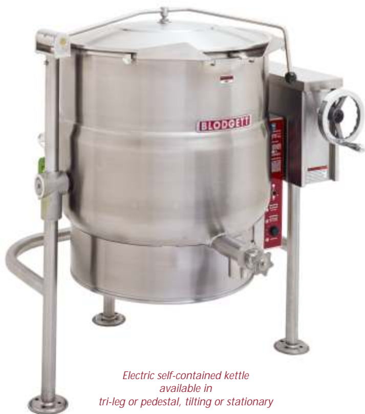
Electric self-contained kettle available in tri-leg or pedestal, tilting or stationary