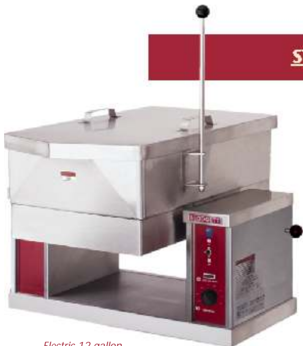
Electric 12 gallon countertop model