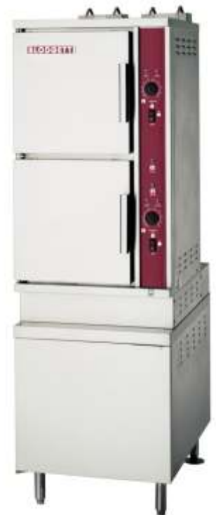
High Efficiency Gas Convection Steamer