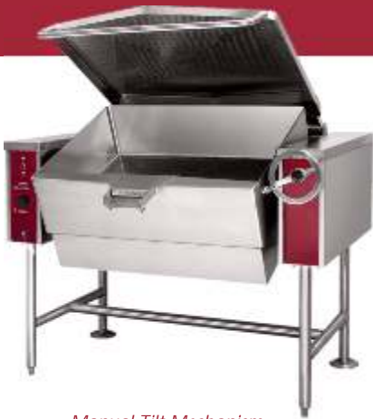
Manual Tilt Mechanism

Blodgett braising pans offer four great tilting mechanisms to choose from.