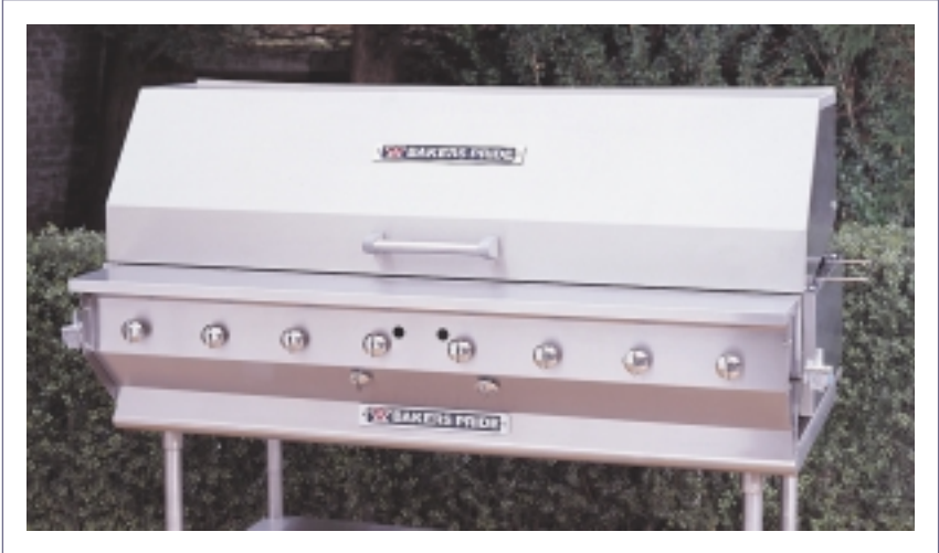
Model CBBQ-60 — with optional 60" roll-top hood