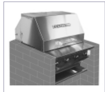
Model CBBQ-30-BI — with roll-top hood