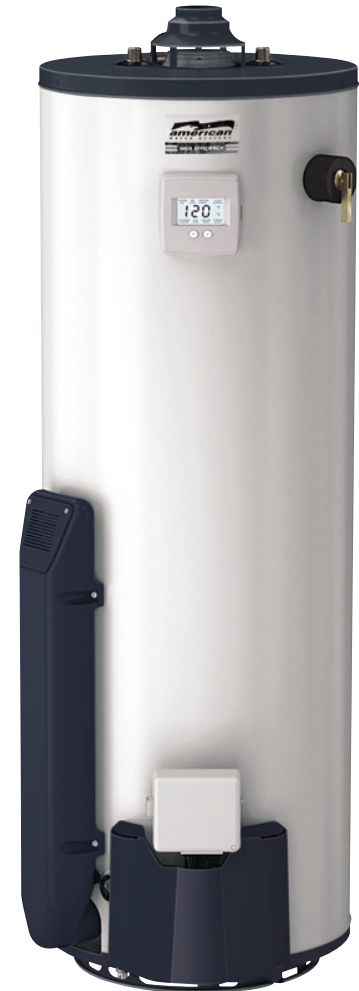
PCG6240T403NOV and PCG6250T403NOV