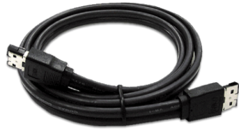
100 cm eSATA cable (2)

WARNING: Please remember to set the power supply to your local outlet voltage prior to plugging in the power cord. Failure to do so may damage the power supply.