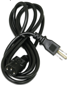
Power Cord (US Version Shown)