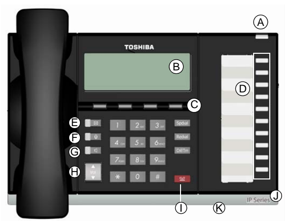
10 Programmable Feature Buttons 4-Line LCD