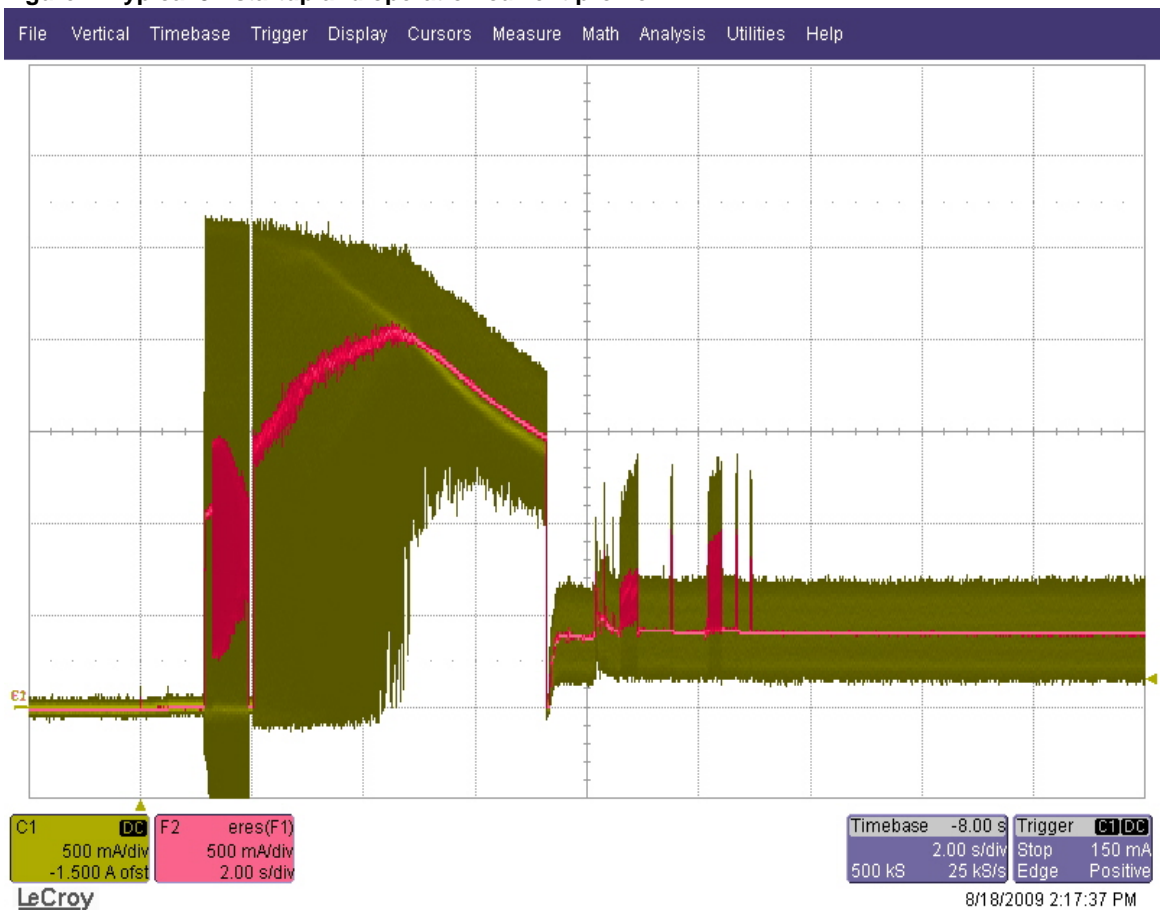
Figure 1. Typical 5V startup and operation current profile