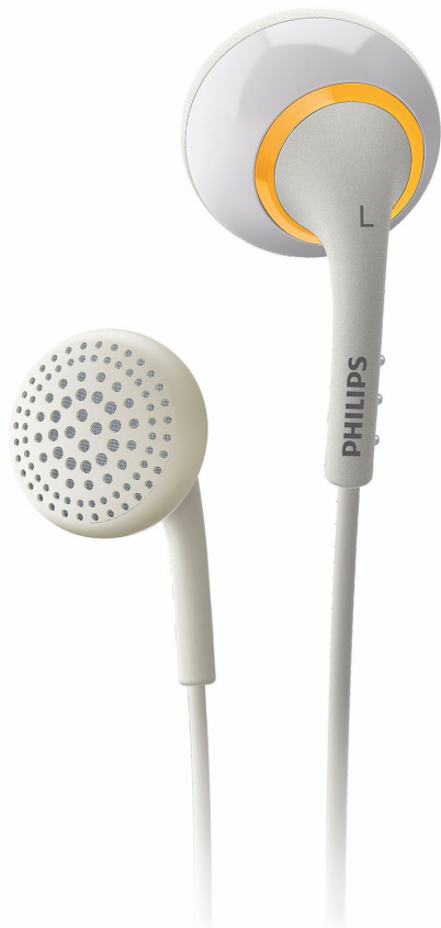
Philips In-Ear Headphones