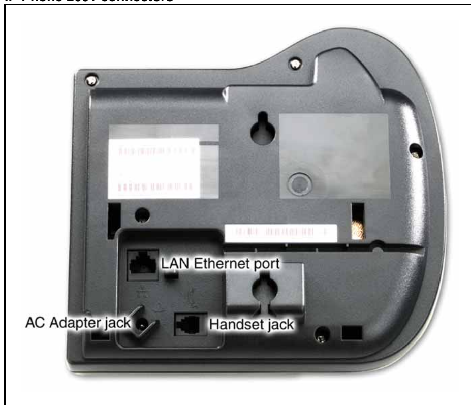
Figure 4 IP Phone 2001 connectors

This figure shows the location of the connectors on the back of the IP Phone 2001 terminal.