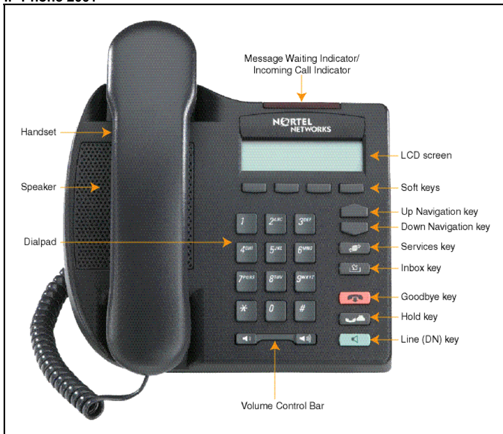
Figure 1 IP Phone 2001