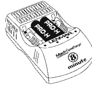
Figure 1 – Two PROH cells only (about 8 minute charge time.)

The Mach 1 Lightning has two special high speed charging slots which are reserved for Lenmar's PROH high current cells. When charging two cells only, please follow the following diagrams which show where to insert different cells to be charged. The fast 8-minute charge will occur only if two PROH cells are installed in the middle two slots. All other combinations will result in a 15-minute charge rate. For best results, use Lenmar PROH batteries with this charger.